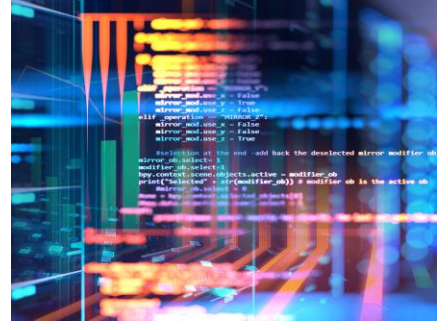
Applying technology to sustainability