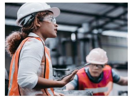
Respecting fundamental rights