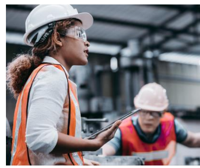
Respecting fundamental rights