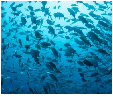
Safeguarding natural systems