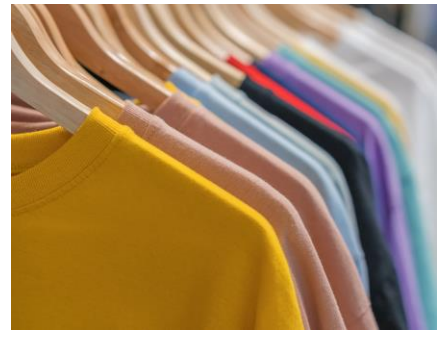
Enabling sustainable consumption and production