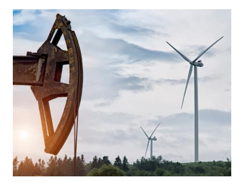
Responding to climate change