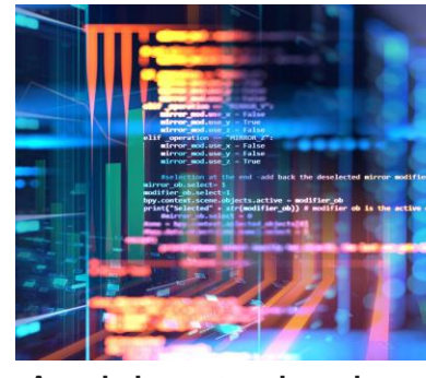
Applying technology to sustainability