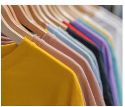
Enabling sustainable consumption & production